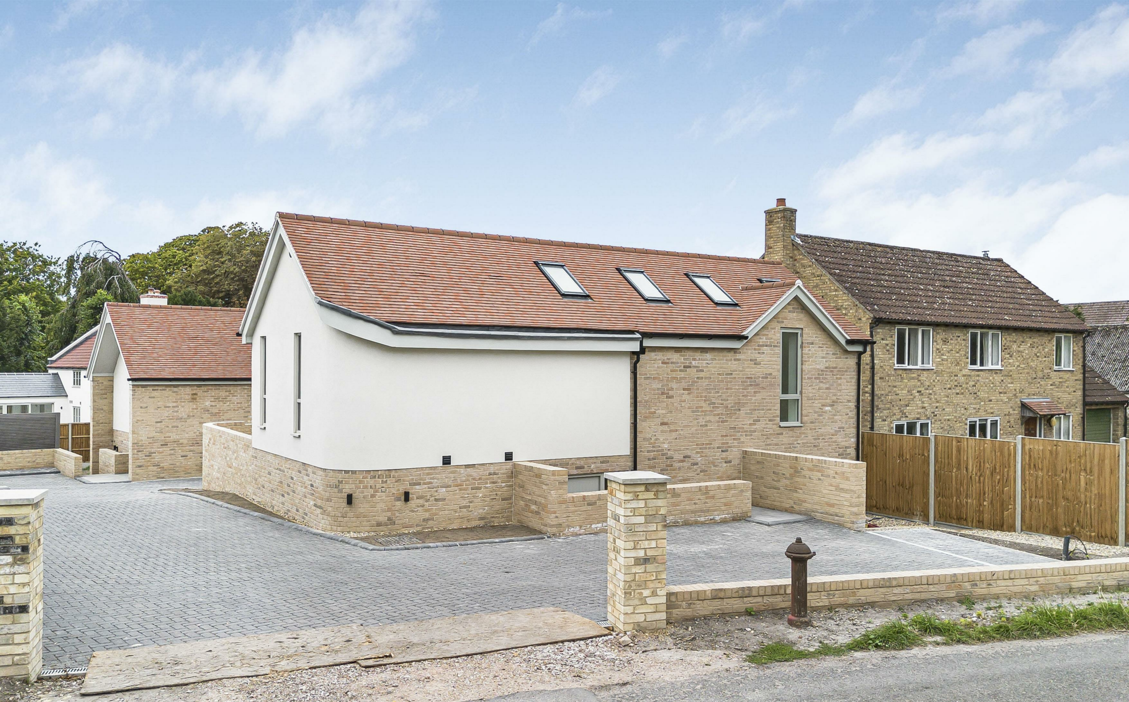
Pudding House, Mill Lane, Burwell CB25 0HJ